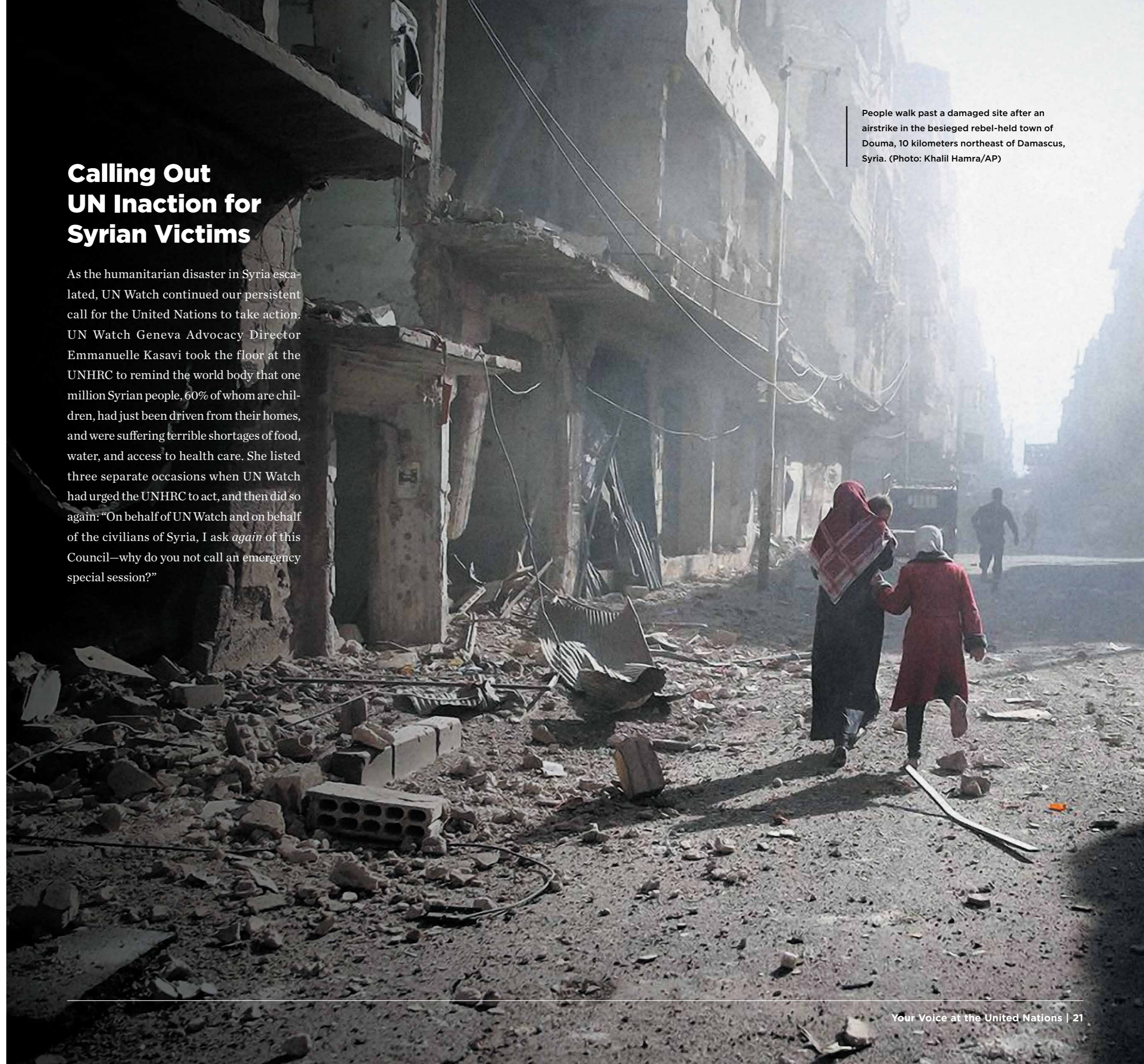
People walk past a damaged site after an airstrike in the besieged rebel-held town of Douma, 10 kilometers northeast of Damascus, Syria.