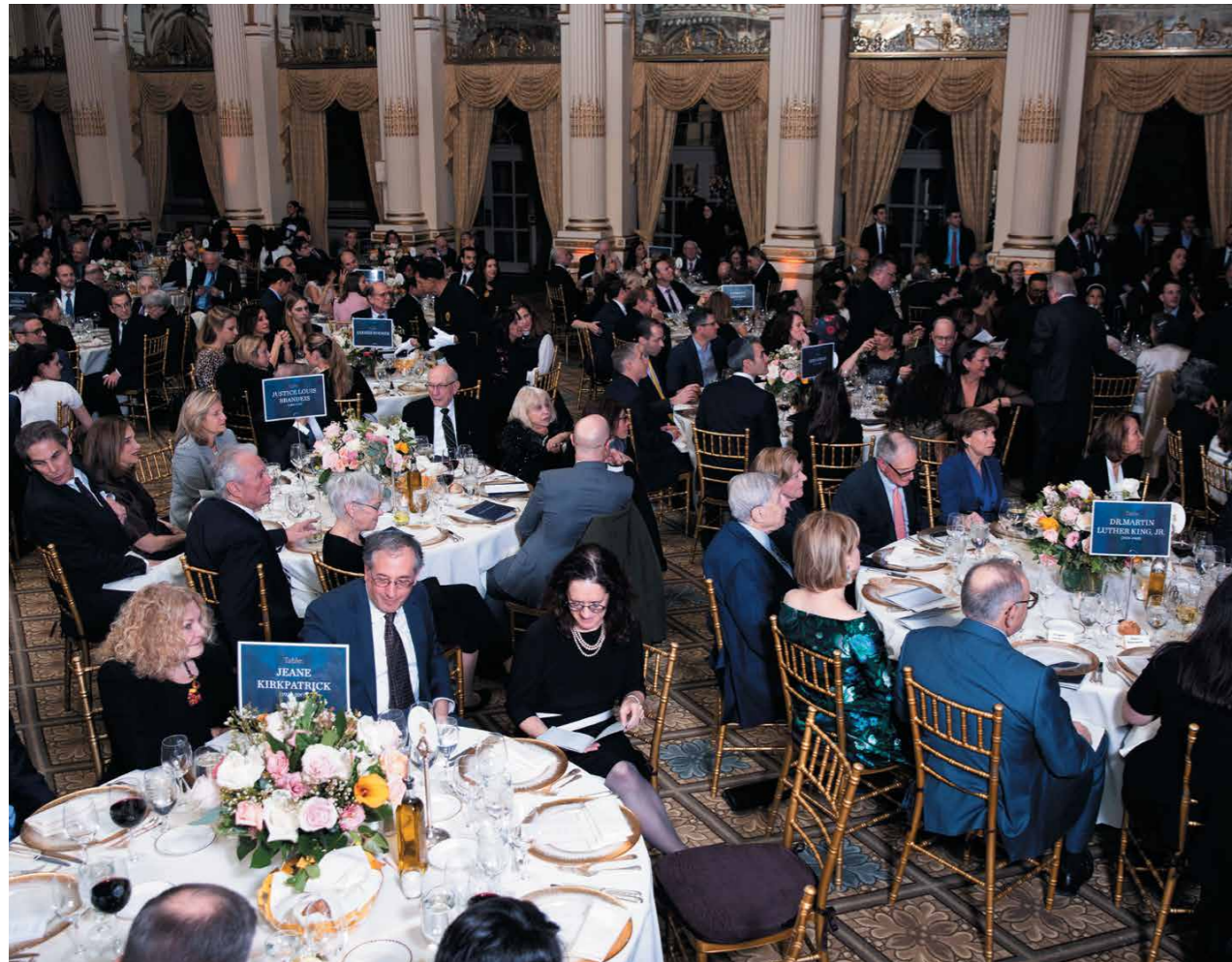
UN Watch supporters from around the world gathered at the Plaza Hotel in December 2019 for the organization’s Inaugural New York Gala.

“We need more people like that,” he says, “who fight an uphill battle with the world against them because they believe so strongly in their mission. We are so proud to have met him, and to be part of this vital organization and cause.”