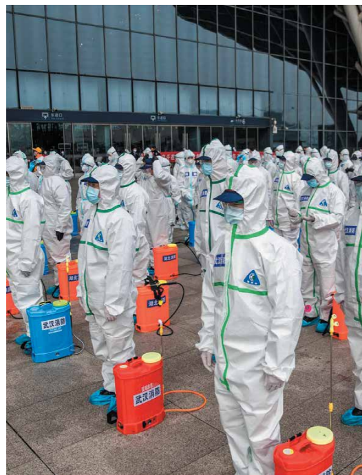
Staff members line up at attention as they prepare to spray disinfectant at Wuhan Railway Station on March 24, 2020.

In advance of the May 2020 assembly of the World Health Organization, UN Watch launched a media campaign exposing the dangerous agenda of James Chau, a presenter on state-owned Chinese TV appointed by the WHO as a "goodwill ambassador." Executive Director Hillel Neuer published an op-ed in Newsweek detailing Chau's long record as a propagandist for Beijing, and how he weaponized his WHO position to whitewash China's actions surrounding COVID-19. UN Watch escalated the pressure by organizing a joint appeal by 100 NGOs for Chau to be removed. As the story spread—reported by Germany's Der Spiegel , UK's Daily Mail , and Spanish newswire EFE—the WHO placed Chau's position "under review."