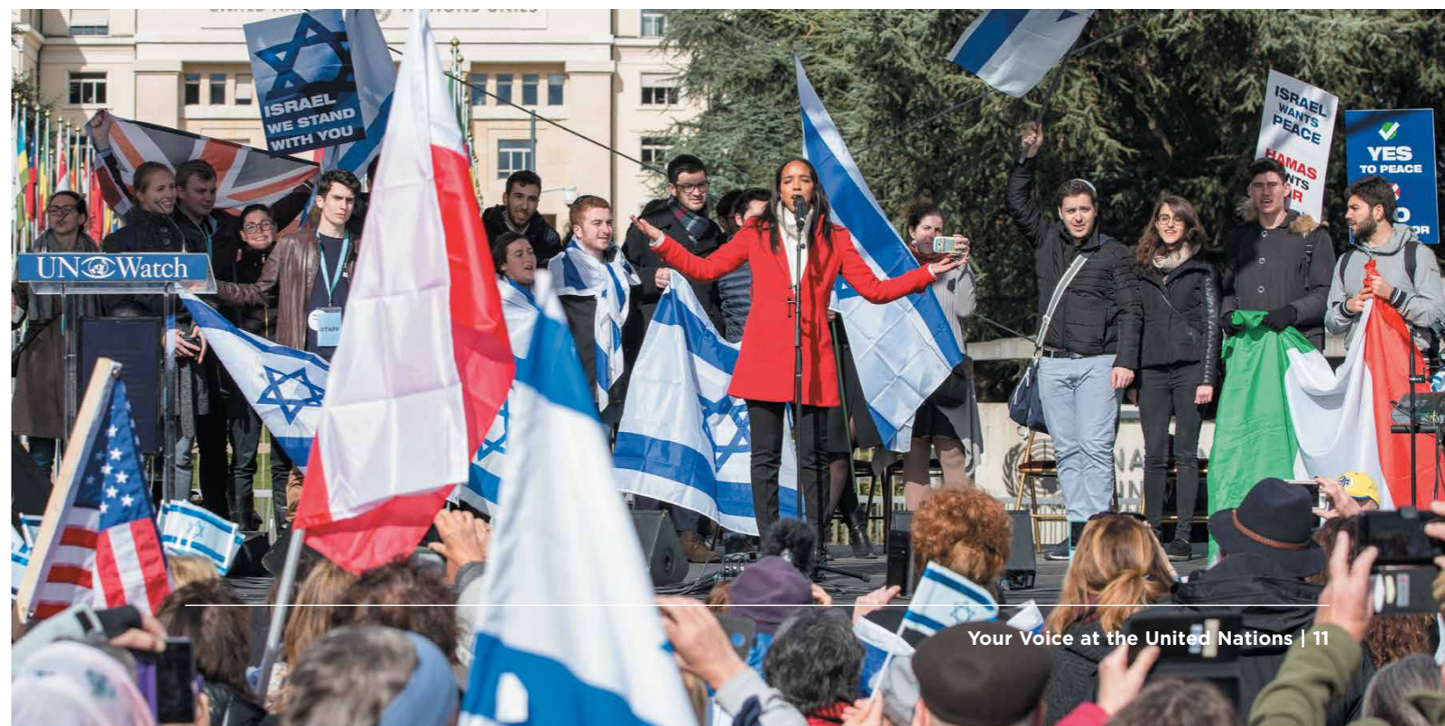
At the UN Watch rally, Israeli singer Hagit Yaso inspired the audience of 1,000 supporters, drawn from countries all across Europe, with her musical performance.

Together, UN Watch and its allies are effecting change, combating the UN's scapegoating of Israel and exposing hypocrisy and bias.